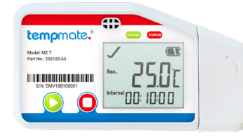
Main Technical Specifications tempmate.®-M2 TH