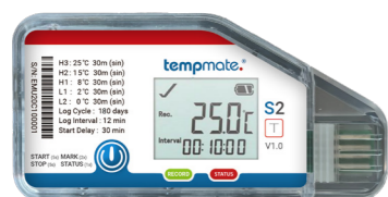
Main Technical Specifications tempmate.®-S2 T